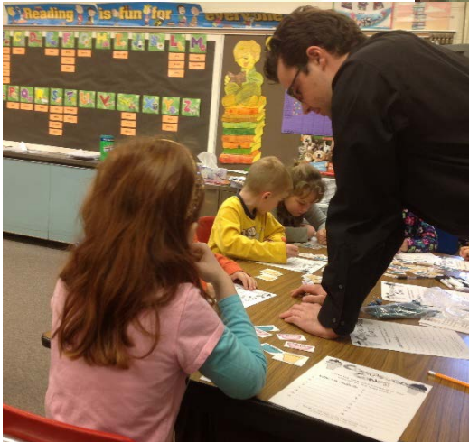
MASON-MONTGOMERY ROAD / BETH