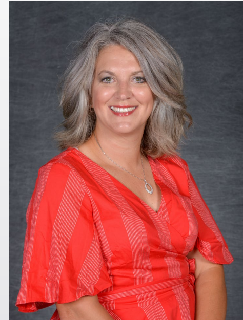
Assistant Professor of Management & Student Success Analytics Outreach Coordinator College of Business Minnesota State University, Mankato