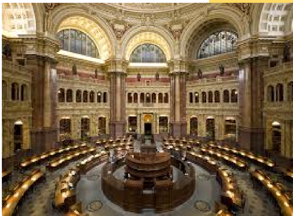
Library of Congress, Washington, D.C. Photo courtesy: Max Pixel