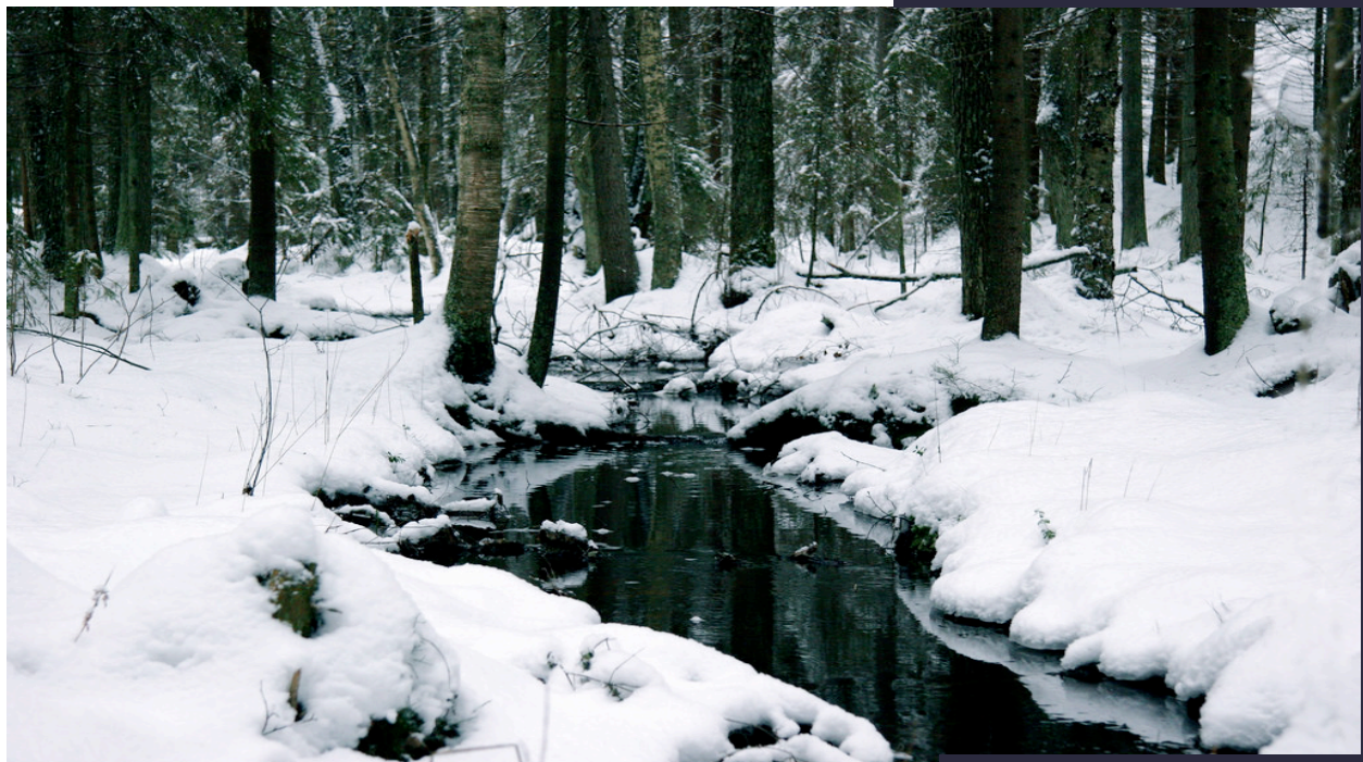
Nuukio National Park, Finland