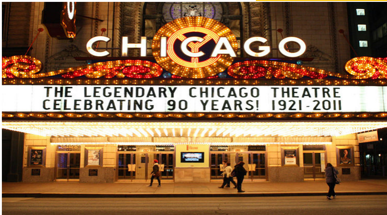
Chicago Theater