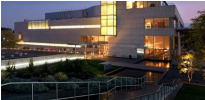
Virginia Museum of Fine Arts (VMFA website)

Impressionist and Post-Impressionist art, British sporting art, Fabergé jeweled objects, and English silver. The museum's holdings of South Asian, Himalayan, and African art are among the finest in the nation.