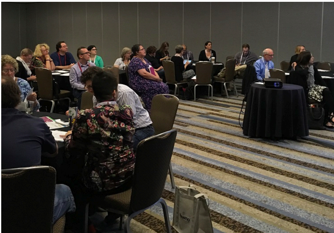
OLAC Membership Meeting