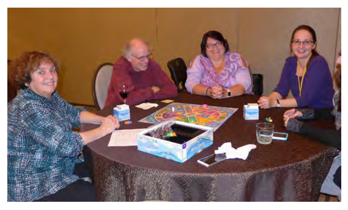
A game of Trivial Pursuit at the Reception