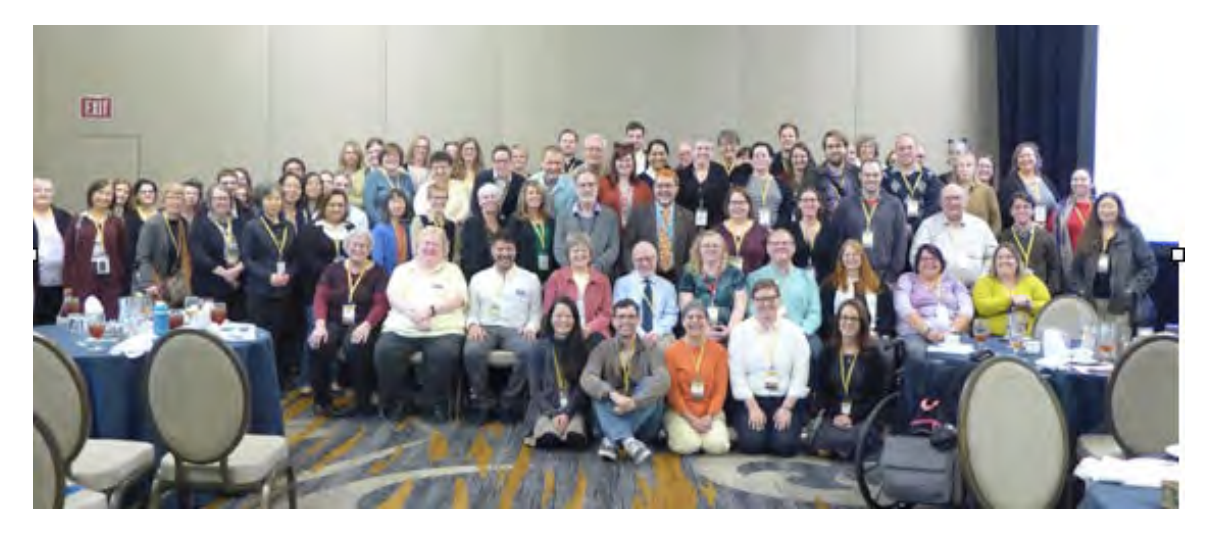
OLAC Conference Attendees after the Saturday Luncheon Membership Meeting

You know the adage about pictures being worth a thousand words, so I'm going to let the pictures tell some of the story: