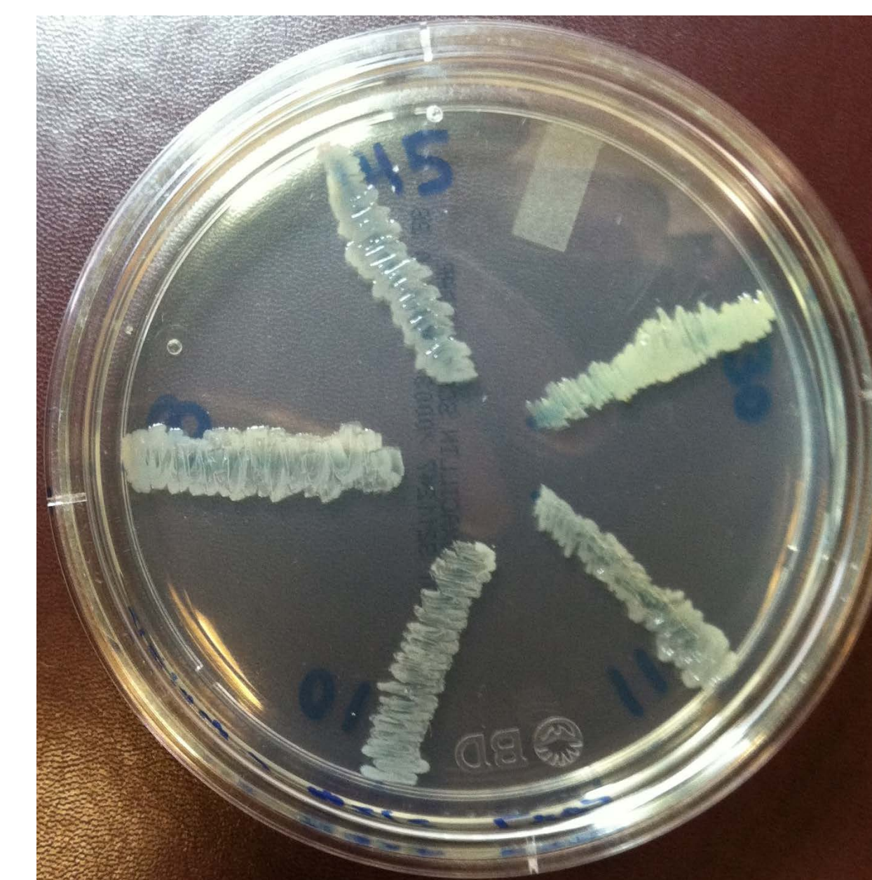
Figure 2. Isolates growing on oxacillin screening agar. This medium contains 6 µg/ml oxacillin; isolates are classified as oxacillin resistant at MIC ≥ 4 µg/ml.