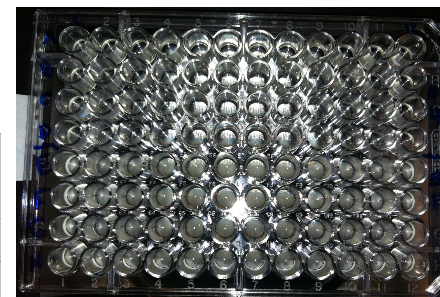
Figure 3. MIC testing. Two-fold serial dilutions ranging from 32 to 0.016 µg/ml (left to right) were prepared. The isolates in the top 4 rows had an MIC of < 0.016 µg/ml, and the MIC of the isolate in the bottom 4 rows was > 32 µg/ml.