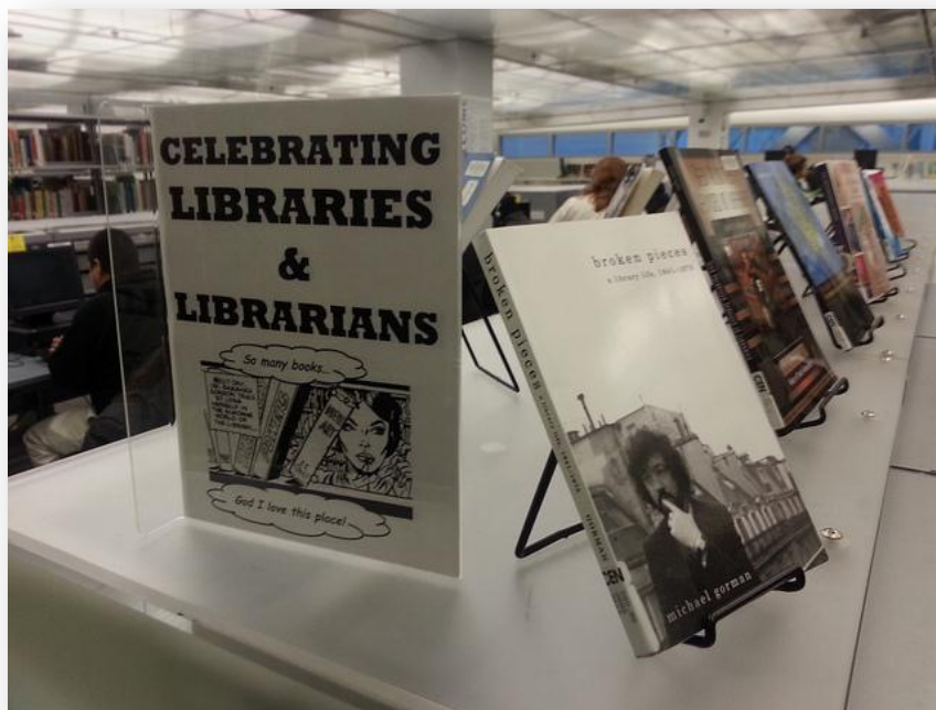
At the Seattle Public Library

At the November 2011 JSC meeting the instruction at RDA 7.24.1.3 for artistic and/or technical credits was expanded from its initial scope of moving image resources to also include audio and multimedia resources. It was noted at that time that there did not seem to be a principled distinction underlying the separation of the statement of responsibility element in chapter 2 and the performer, narrator, presenter and artistic and/or technical credit elements in chapter 7. The statement of responsibility is transcribed and mapped to the manifestation. The elements in chapter 7 are not transcribed and are mapped to the expression. ALA was asked to investigate this inconsistency in treatment and at the January CC:DA meeting, OLAC and the Music Library Association were charged with following up on this task.