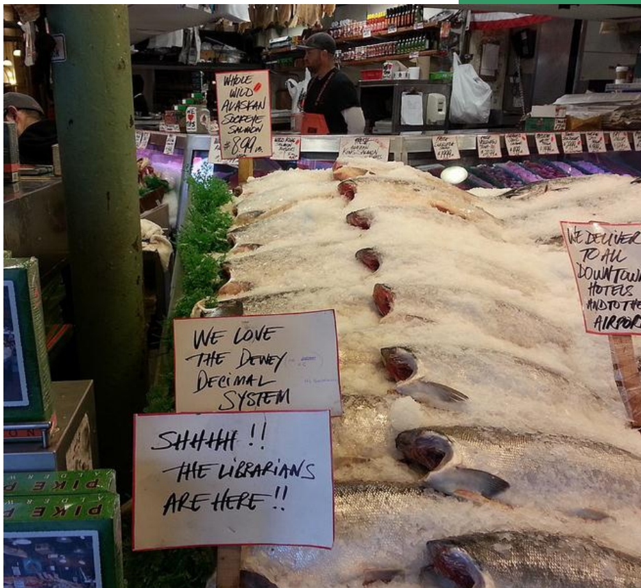
ALA Midwinter in Seattle