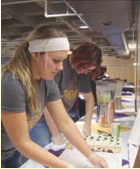
With focused concentration students from the Centennial Student Union Bullpen distribute the much anticipated celebratory cake.