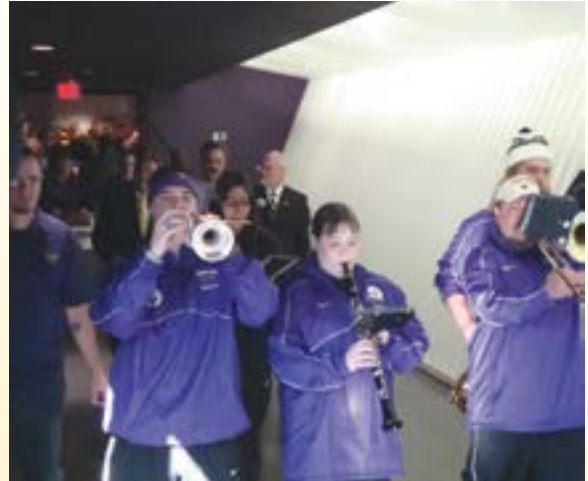
The Minnesota State University Pep Band leads the procession through the Pedestrian Connection.