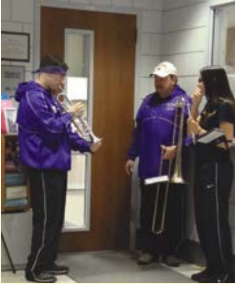
The Pep Band warms up before the Grand Opening ceremony.