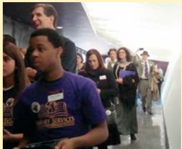
Members of the campus community get their first look at the Pedestrian Connection.