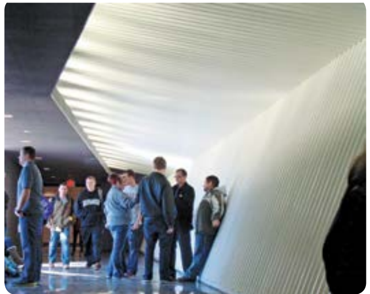
Students enjoying the completed Pedestrian Connection.