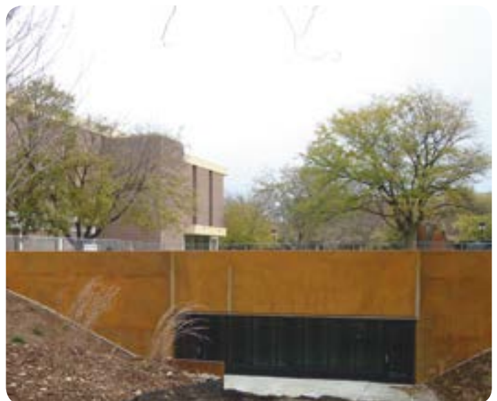
View of the Pedestrian Connection from west side of the campus.