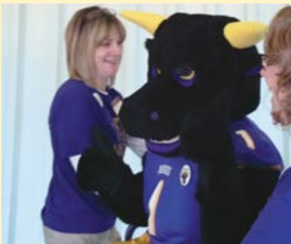
The Memorial Library and Centennial Student Union connection gets "thumbs up" from Stomper.