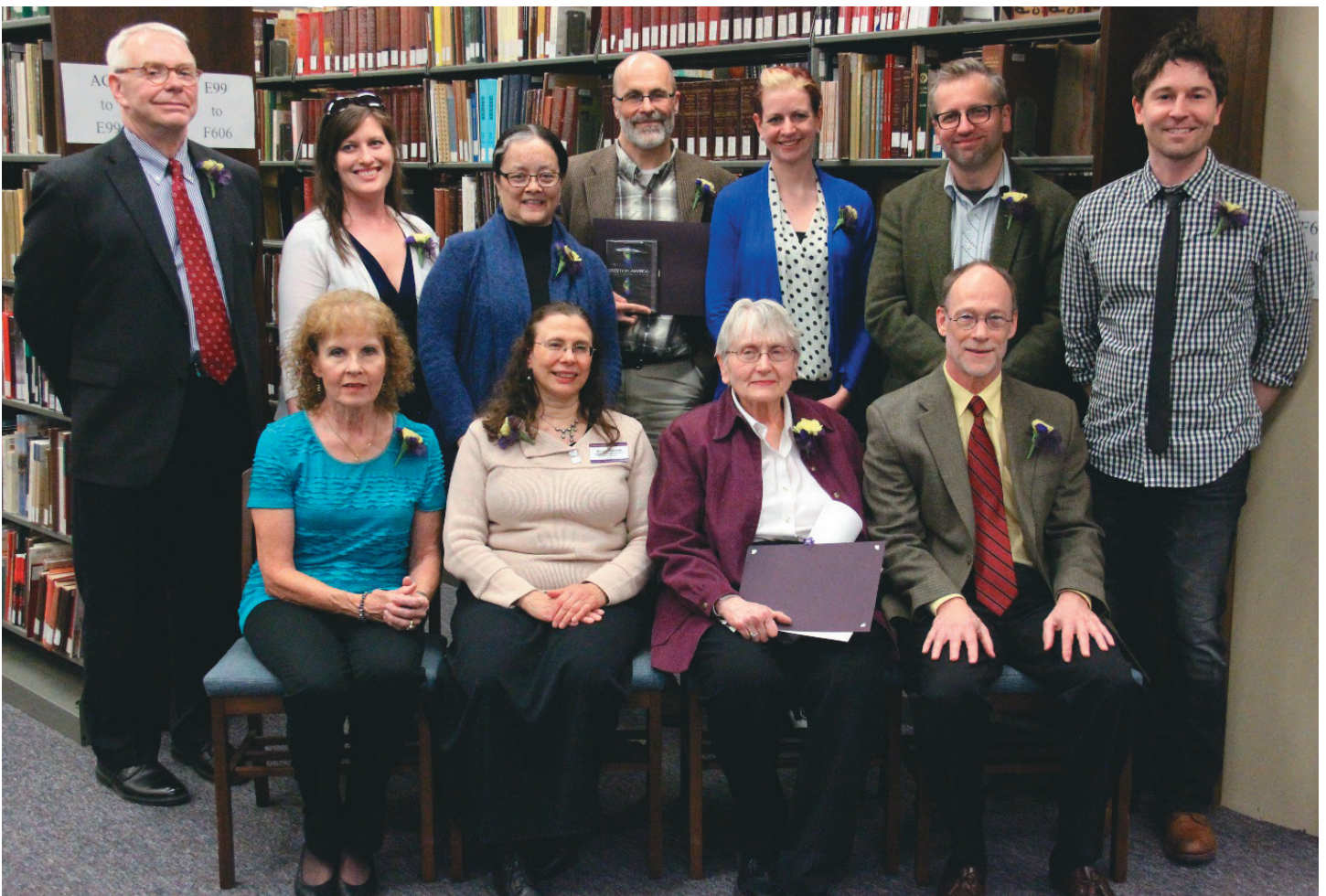
MSU Authors at Reception held in the Marilyn J. Lass Center for Minnesota Studies, Memorial Library – April 2014

Did we miss you? Or do you just now have a book coming out? If you have published a book, video, score, etc. since March 2014, please contact the University Archives at 507-389-1029 or archives@mnsu.edu . We do our best to acquire new materials published each year. We also appreciate donations of MSU Author books whenever possible. http://lib.mnsu.edu/archives/authors/intro.html