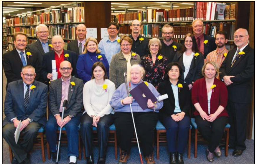
2016 MSU Author Event.