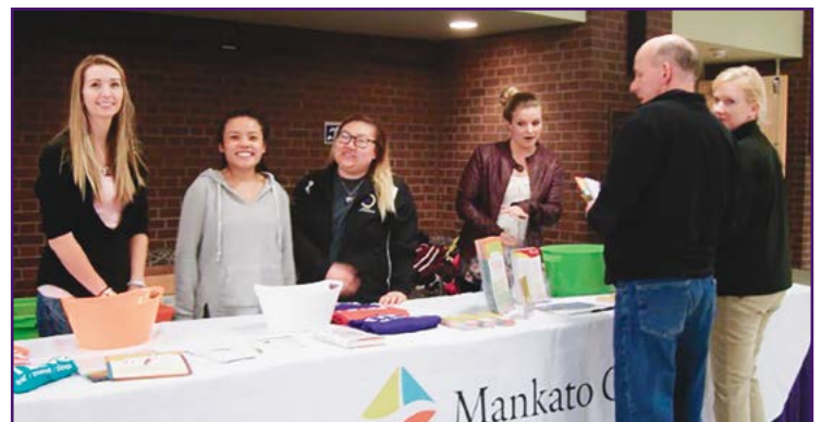
Smiling faces greet attendees to the film showing of Fully Charged sponsored by the Mankato Clinic and Library Services.