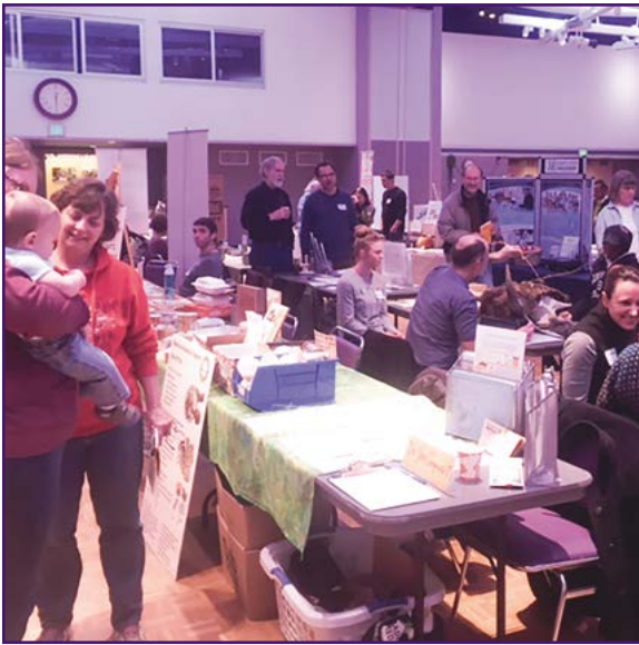
People stop to talk to different organizations in the CSU Ballroom at the 2016 Sustainability Expo.