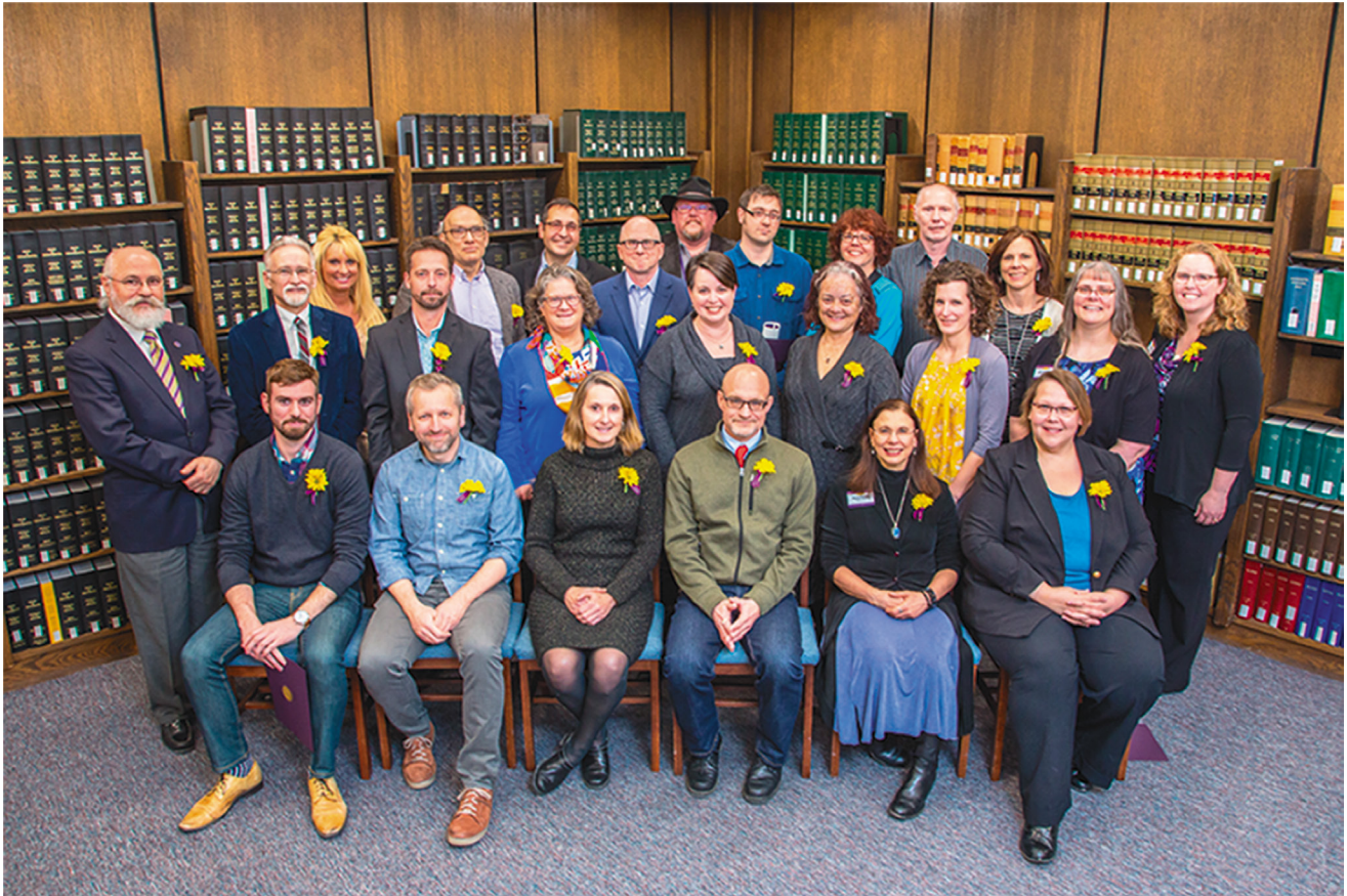
A group photo of honorees attending the Minnesota State University, Mankato Authors reception on April 4, 2018.

A complete list of the 2018 honorees and additional information about the April 4, 2018 event can be found online at http://lib.mnsu.edu/archives/authors/2018event.html