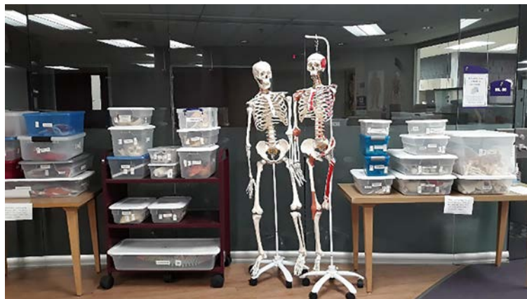
Anatomy models continue to be available for student use. Models can be found on the lower level of Memorial Library. Students can take these items for study to any table located in the Educational Resource Center.

The campus event was organized by Library Services with participation from Campus Election Engagement Project; Community Engagement; Maverick Involvement Team; Maverick Speech and Debate; MSU College Democrats; MSU College Republicans; St. Peter League of Women Voters; Student Government; and the Student Events Team.