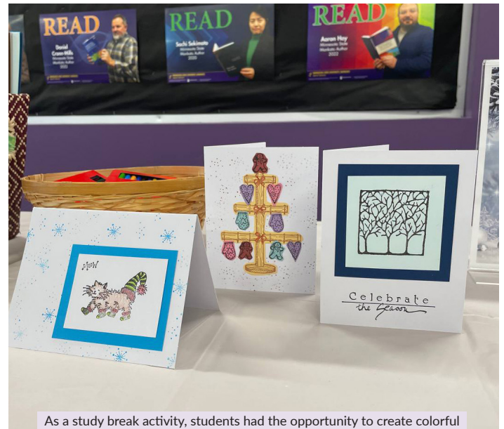
As a study break activity, students had the opportunity to create colorful handmade holiday cards in the Library the week of November 27.