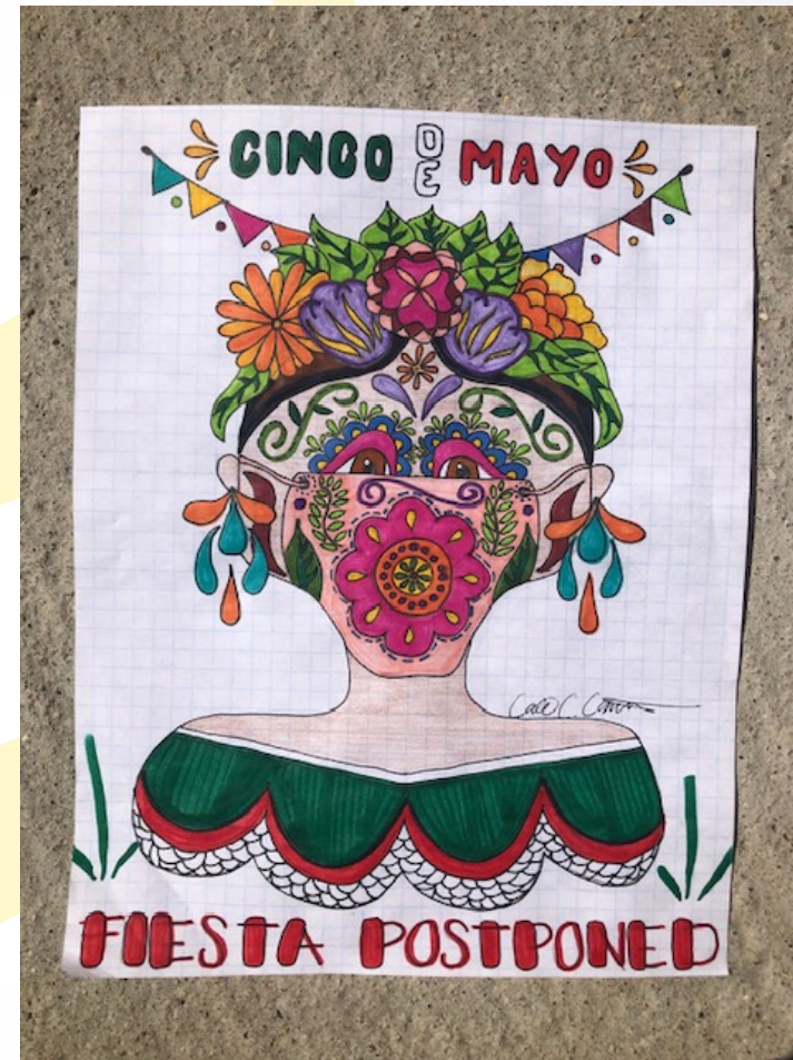
“Fiesta Postponed” by Cali Cantu