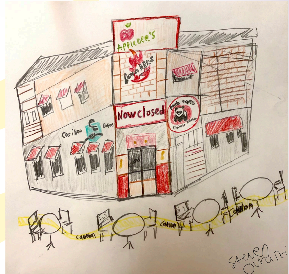
“Closed Restaurants” by Steven Orvaiti