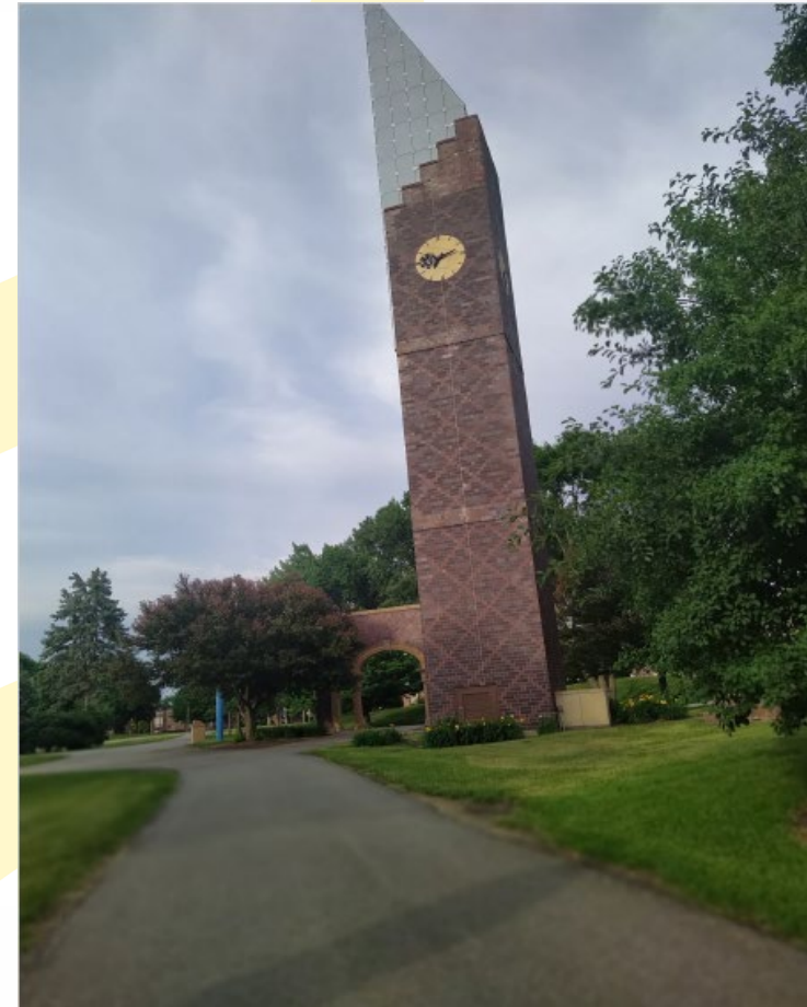
Photograph by Anonymous student of Ostrander Student Memorial Bell Tower