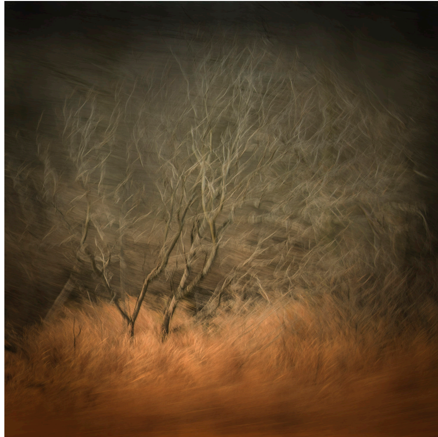
Mount Horeb's Bramble Digital photograph