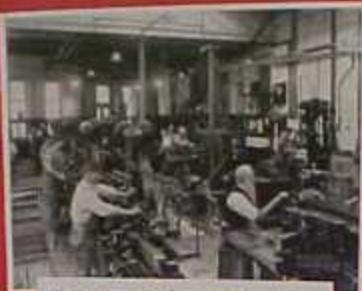
Workers at the Government Printing Office, 1910-1922