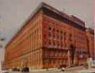
1850s Government Printing Office building in Washington, D.C.

The History of IES In 1862, the Department of Education was established as the Office of Education, the first federal department devoted to education. It was created by an act of Congress that also established the Department of the Interior and the Department of Justice. The Department of Education was reorganized in 1979 as the Department of Education, and in 1980, the Department of Education was renamed the Department of Education. The Department of Education has a long and distinguished history of providing leadership and support to state, local, and tribal education agencies and to the nation's schools and colleges. The Department of Education is committed to ensuring that all students have the opportunity to succeed in school and in life. It works to improve the quality of education for all students, to ensure that all students have access to a high-quality education, and to ensure that all students are prepared for the workforce and for college.