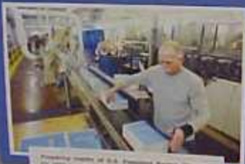
Printing press at U.S. Post and Service Center 27 2012 image of the Government Printing Office in Washington at Internet, 10, 2017

Government Printing Office is the "backbone of the printing" in printing the "Governmental Service" a new source of information and services from the U.S. Government Printing Office and the "Governmental Service" printing press. (10/10/2017)