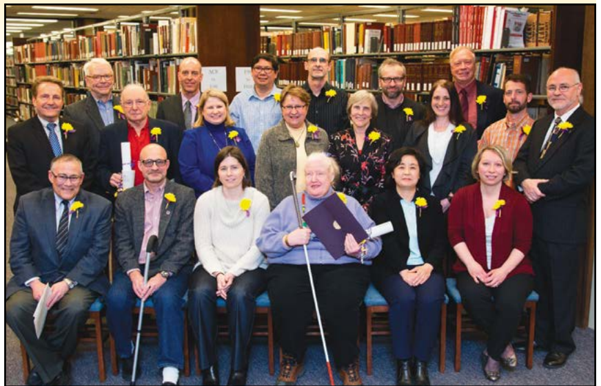
2016 MSU Author Event.