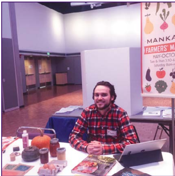
The Mankato Farmer's Market table displays a variety of locally grown items that can be purchased.