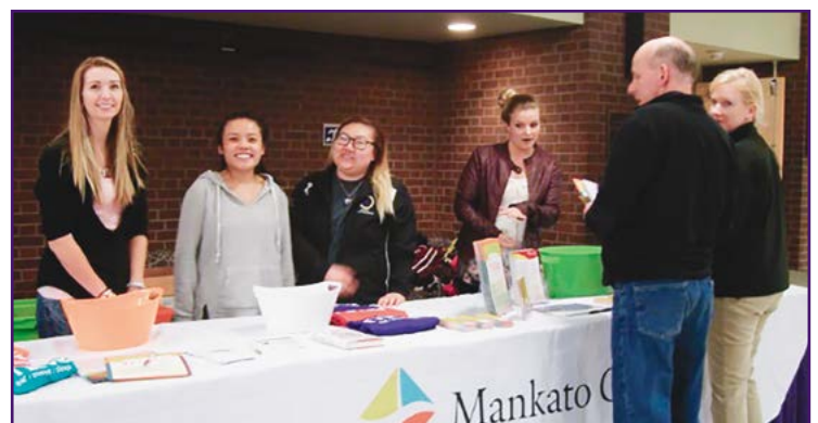
Smiling faces greet attendees to the film showing of Fully Charged sponsored by the Mankato Clinic and Library Services.

As part of its 100 th year anniversary celebration as a local health care provider, the Mankato Clinic partnered with Library Services at Minnesota State Mankato to show the movie, Fully Charged . The free event was part of Mankato Clinic's Thrive campaign and took place in Ostrander Auditorium on March 22, 2016. The documentary film is based on Tom Rath's book, Eat Move Sleep and it focused on individuals who have transformed their lives by making healthier choices.