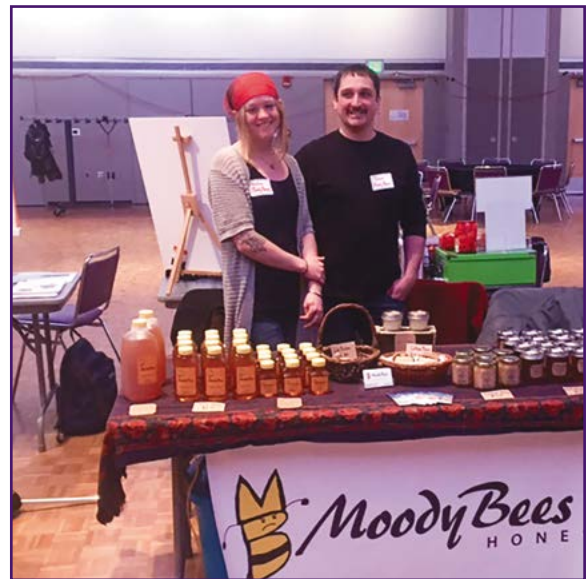
Moody Bees Farm was one of several local food producers that attended the Sustainability Expo.