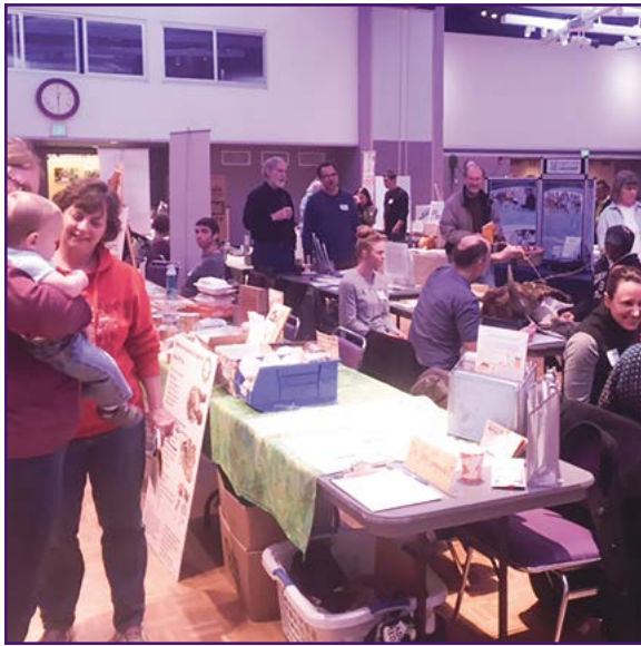
People stop to talk to different organizations in the CSU Ballroom at the 2016 Sustainability Expo.